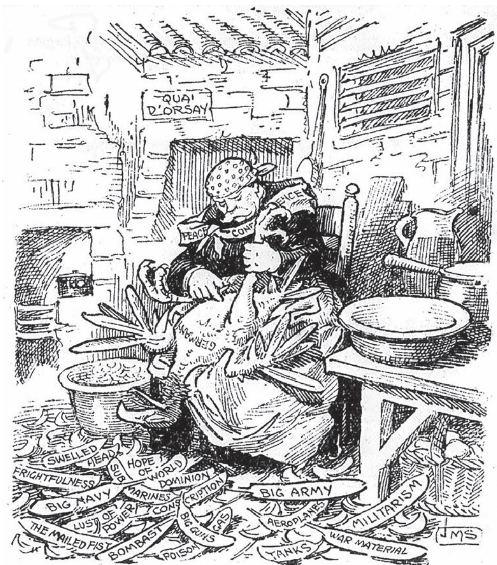
A British cartoon published in March 1919. The Quai d'Orsay was the address of the French Ministry of Foreign Affairs.