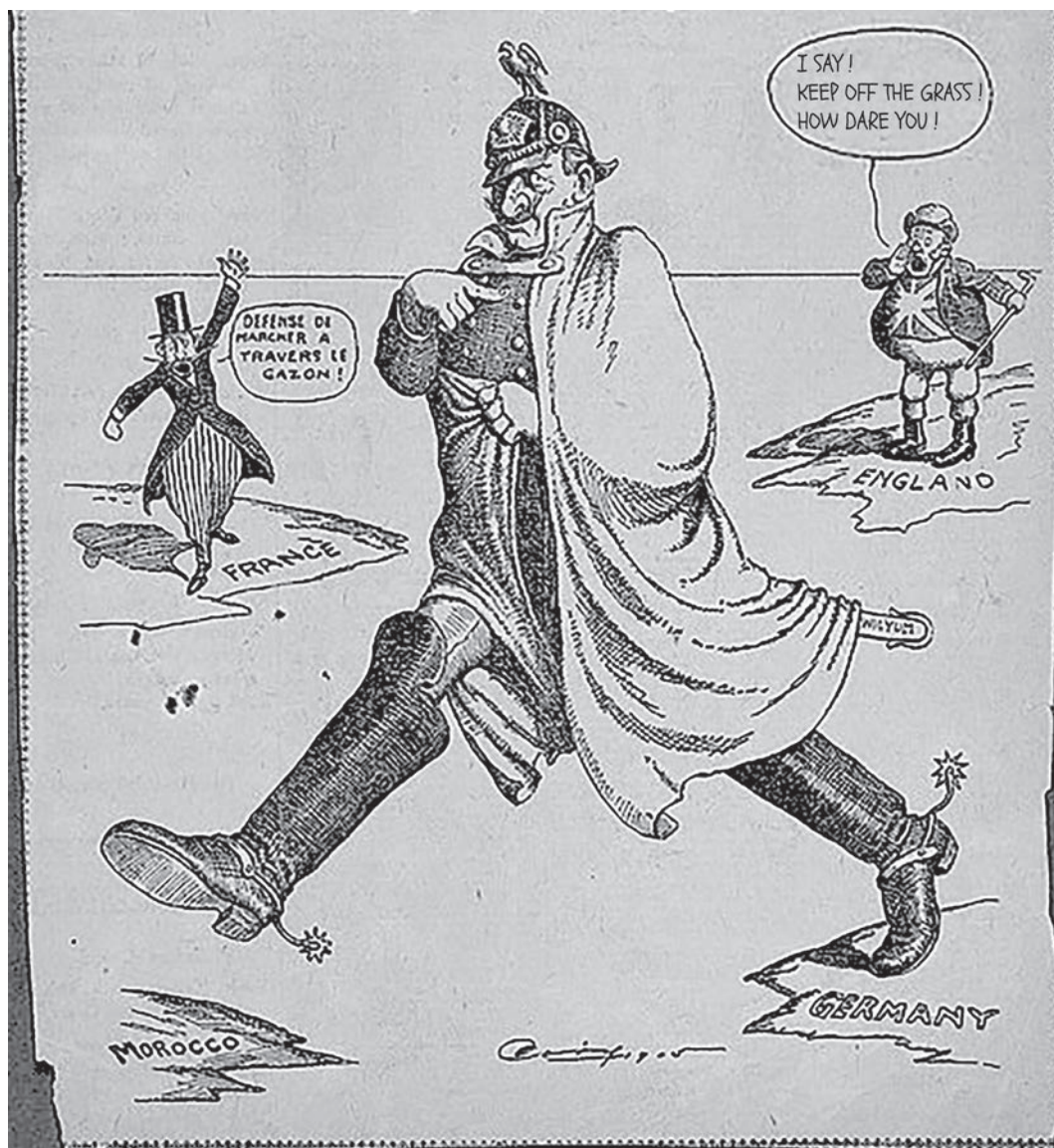
A cartoon published in a British magazine, 29 April 1905. France is shouting, 'Forbidden to walk on the grass!'