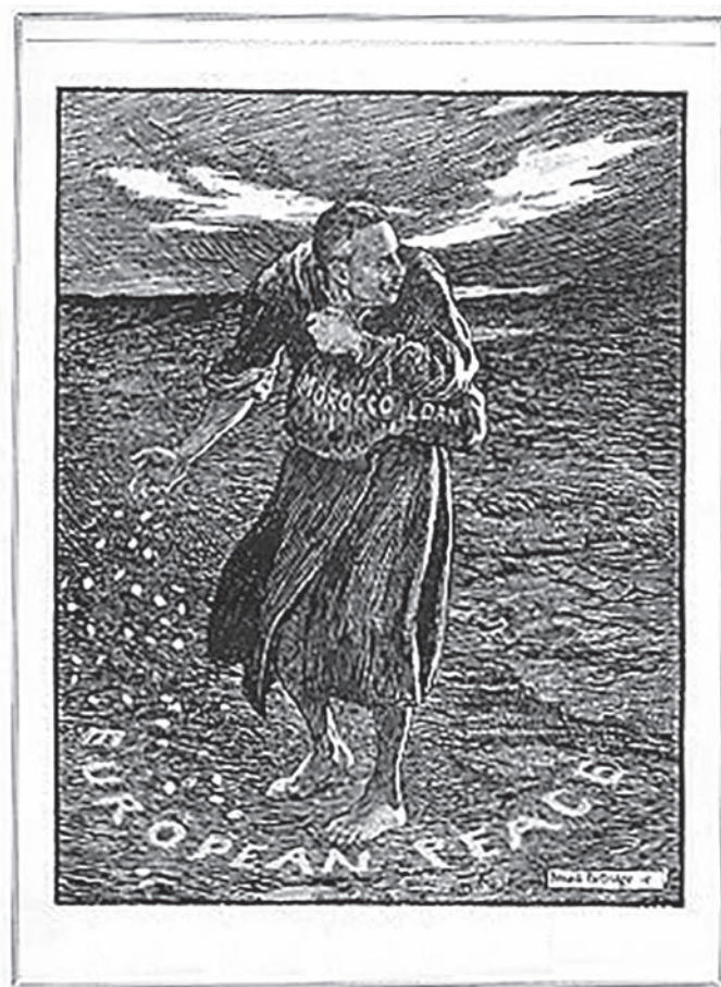
A cartoon published in a British magazine, August 1905. The title of the cartoon is 'The spreader of harmful weeds'. The figure represents the Kaiser.